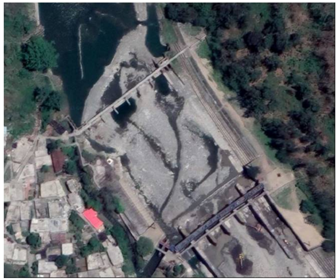
LOCATION OF BARRAGE (LATITUDE AND LONGITUDE)

The Gaula River is a river which originates in Uttarakhand State of India flows south past Kathgodam, Haldwani, and Shahi, finally joining the Ramganga River about 15 km (9.3 miles) northwest of Bareilly in Uttar Pradesh. Ramganga in turn is a tributary of the river Ganges. A barrage on this river, known as the Gaula Barrage, is located at Kathgodam in Nainital district of Uttarakhand. It is erected over Gaula River (also known as Gaula river). It coordinates on latitudes 29°16'18"N and longitudes 79°32'51"E. The barrage serves as a prominent landmark for the local people. The Gaula Barrage is a vital source of water and is used for irrigating. It provides drinking water to Haldwani city & irrigation water for the bhabar fields.